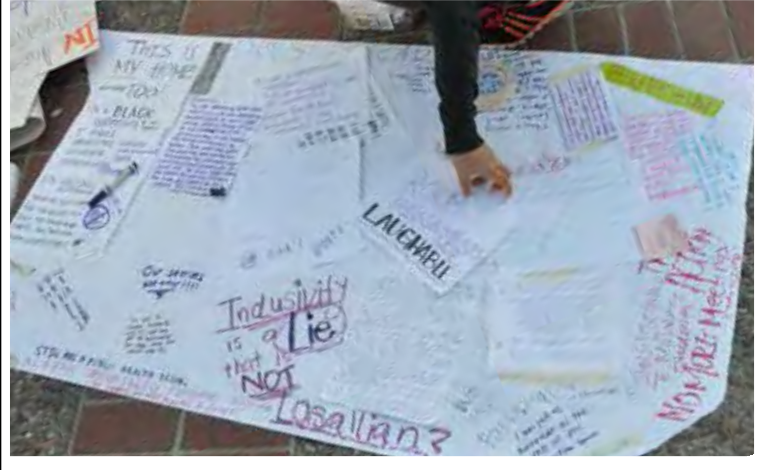
Students wrote their messages on butcherpaper.

developing a policy for the retention of underrepresented faculty; requiring that all students take a diversity course; requiring that public safety improve their relations and stop persecuting students of color; and creating an annual plan of action about how the college will improve the experience of marginalized students.